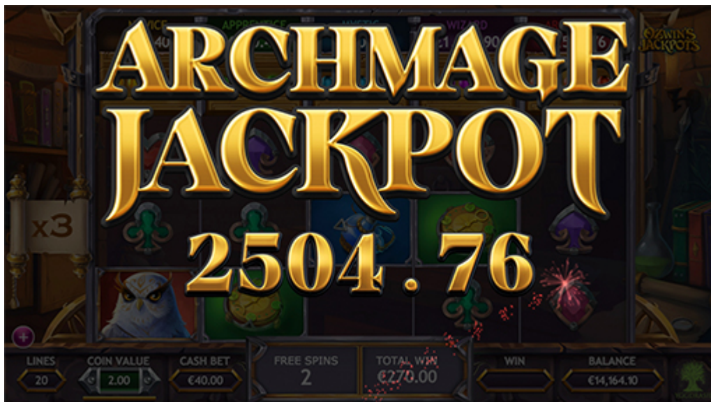
Spellbook bonus game