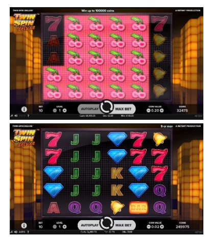
Twin Spin Deluxe™ graphics