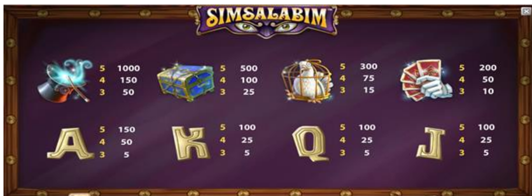
Paytable page 3