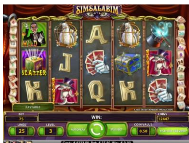
High, Medium and Low win symbols on the reels