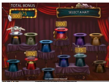
Bonus Game coin wins

The magic happens in Free Spins with bet line wins paying x3.