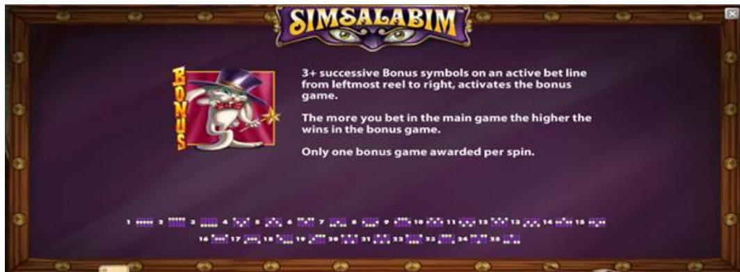
Paytable page 2