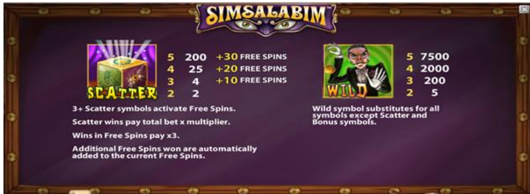
Paytable page 1