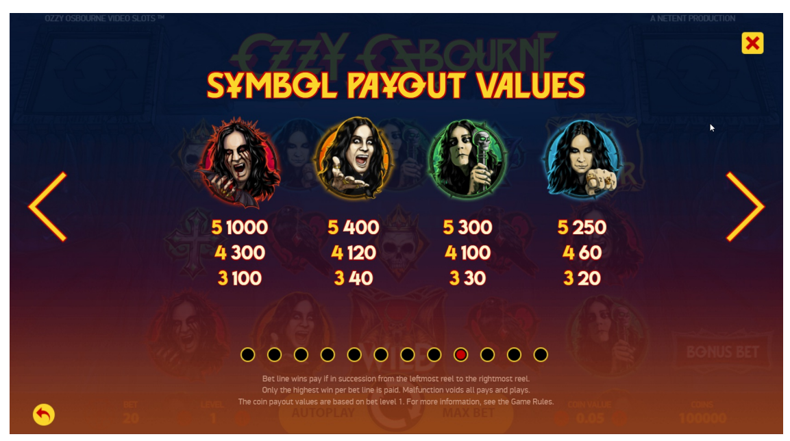
Paytable page 1