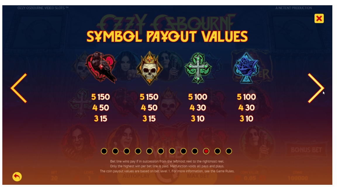
Paytable page 2